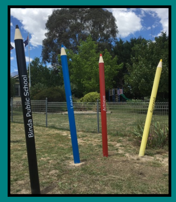
Term 2 Week 8 2018